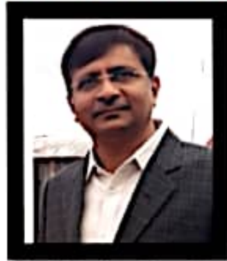
Hon'ble Mr. Justice Anil Kilor Judge, Bombay High Court Chief Guest